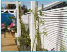
Climbing Rose & Shrub Rose

In-depth, covering all aspect of the garden maintenance. Such as: Paint and varnish information, pruning timings and techniques, fertilisers and when to apply, tools to use.