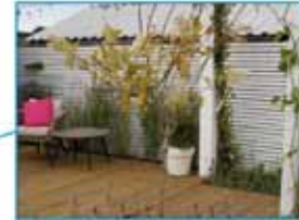
Hydrangea Grandiflora Half Standard