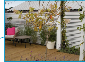
Hydrangea Grandiflora Half Standard