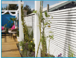
Climbing Rose & Shrub Rose

In-depth, covering all aspect of the garden maintenance. Such as: Paint and varnish information, pruning timings and techniques, fertilisers and when to apply, tools to use.